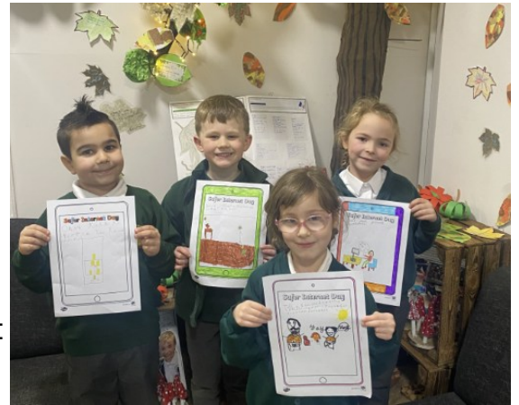
Year 1 making posters with very good advice on what to do if something makes you worried or upset online