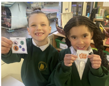
Year 2 deciding what information is okay to share and what is not!

We are absolutely committed to helping the children safely navigate the online world, as we are the physical world. Technology has many benefits and we want the children to be ready for a future that will inevitably be a technological one! But we also want them to be able to understand the drawbacks and difficulties.